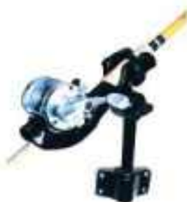
RAM-114-B RAM-114-BU R-A-M Rod 2000 Holder with Bulkhead Mounting Base