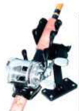
RAM-114-F RAM-114-FU R-A-M Rod 2000 Holder with Flush Mounting Base