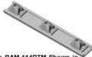
Three RAM-114DTM Shown in Track System made by either Title-Lok or Bert's