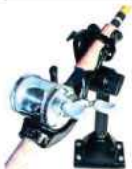
RAM-114-D RAM-114-DU R-A-M Rod 2000 Holder with Deck & Track Mounting Base