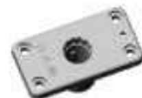
RAM-114FM & RAM-114FMU Flush Mount Base for horizontal surfaces. Bolt hole pattern matches Fish-On and Scotty for easy retrofitting.