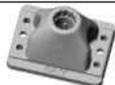
RAM-114DTM & RAM-114DTMU Deck and Track Mounting Base for horizontal surfaces. Bolt hole pattern matches Fish-On and Scotty for easy retrofitting.