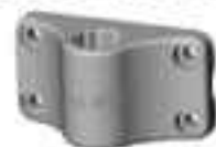
RAM-114BM & RAM-114BMU Bulkhead - Side Mounting Base for vertical surfaces. Bolt hole pattern matches Fish-On and Scotty for easy retrofitting.